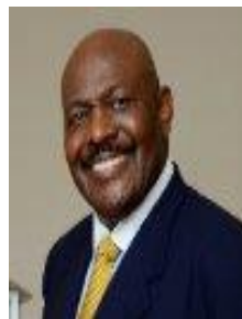
Charles W. Walker Former State Senator